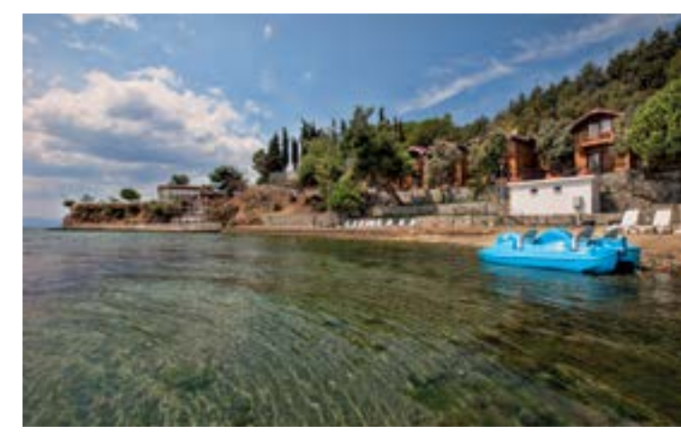
Karacaali Narlı Social Facility

Bursa, which is also rich with its cuisine, presents also traditional Turkish cuisine with modern life by blending. Iskender kebab, İnegöl meatball, candied chestnut and Kemalpaşa dessert can be available easily.