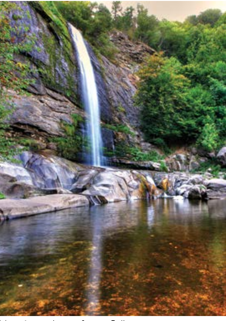
Mustafakemalpaşa, Suuçtu Fall